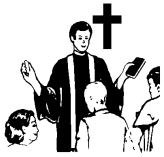
Communal Anointing Liturgy